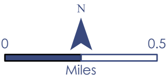
January 2023 VICINITY MAP Figure 1

Maxar Technologies Inc., 2020, Alaska high resolution imagery (5m); Available: https://gis.data.alaska.gov/pages/imagery%20Program .